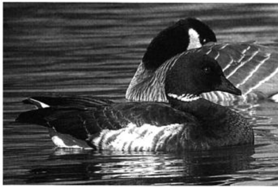
This adult Black Brant at Guymon, Texas County, Oklahoma 13 January 2004 was photographed resting in a local park after forays to local fields. The state has only a handful of records of this subspecies.