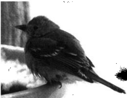
A rare find was this female Western Tanager coming to a feeder in Manhattan, Riley County, Kansas 31 January 2004.

Incredible numbers of sparrows were found in Cowley , KS, including 3000 American Tree Sparrows and 5000+ Harris's Sparrows ( vide MT). Unusual in midwinter, single Lark Sparrows appeared in Oklahoma in Alfalfa 9 Feb (GL, LL, JLa) and Osage 29 Jan (RA). A Savannah Sparrow in Otoe , NE (LF, CF) was only the 2nd in midwinter for Nebraska, as was a Lin-