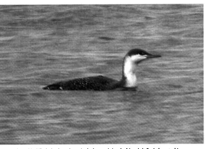
Casual in Mississippi, and particularly rare inland, this adult Red-throated Loon was photographed 4 February 2004 at Bay Springs Lake, Tishomingo County.

(DPh, SP). Golden Eagle singles were at Dugger Mt./Talladega N.F., Cleburne, AL 6 Feb (RyS), Holla Bend N.W.R., Pope, AR 16 Dec (LA), and near Collins, Drew, AR 27 Dec (WB), while 2 were at Mollicy W.M.A., Morehouse, LA 23–24 Jan (m. ob.). Crested Caracara is found consistently in the Region only in sw. Louisiana; 2 were in Jefferson Davis 14 Dec (m. ob.), an imm. was n. of Avery I., Iberia 22 Dec (DPa, PC), and one was in Calcasieu 25 Feb (JK). Merlins were widely reported, with 3 in Alabama and 8 in Mis-