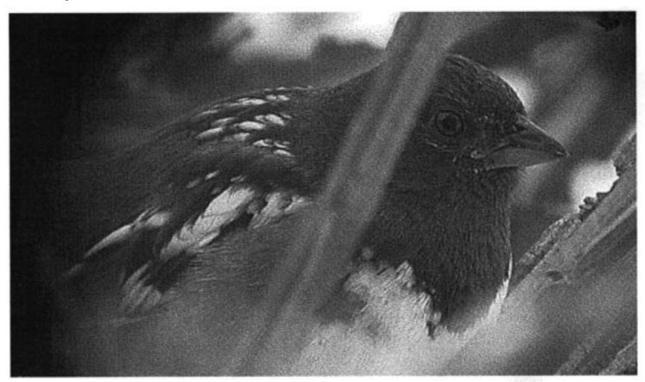
New Hampshire hosted two Spotted Towhees this season, with the first, in Grafton, showing up in November and providing the state with its first record. The second, shown here, was discovered during the Concord C.B.C. in Merrimack County on 14 (here 16) December 2003. Both birds remained through the winter.

The presence of 2 Sandhill Cranes at a bird feeder in Barnstable, Barnstable , MA 8 Dec–8 Feb brings new meaning to the term "feeder bird." The cranes in question were regularly