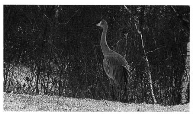
One of two that spent much of the winter visiting a bird feeder in Barnstable, Massachusetts, this Sandhill Crane was photographed there 8 December 2003.

There is rarely much mention of common "feeder birds" in these pages, but every now and then we need a reminder that not all areas are equally saturated with familiar winter residents. For example, Tufted Titmouse and White-breasted Nuthatch are still rare or even absent on Massachusetts' offshore islands, so a titmouse on M.V. 1 Feb (AK) and a nuthatch on Nantucket 22 Jan (E. Ray) are worthy of note. After last year's scarcity, observers in the Region were ready for an influx of Red-breasted Nuthatches, and the fall flight certainly