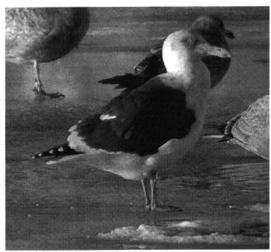
This gull, identified as a Slaty-backed Gull, was discovered at the Rochester, New Hampshire Wastewater Treatment Plant on 24 December 2003, a potential first state and Regional record. The gull was seen regularly through 27 December (here).

Seawatches in Dec also tallied good numbers of Northern Gannets, although the species was not as abundant as in the previous winter. High counts include 2500 at First Encounter 8 Dec (BN), 390 at P'town 6 Dec (BN), 373 on Stellwagen Bank 20 Dec, and 1000 off Pt. Judith 15 Dec. While Double-crested Cormorants are increasingly common