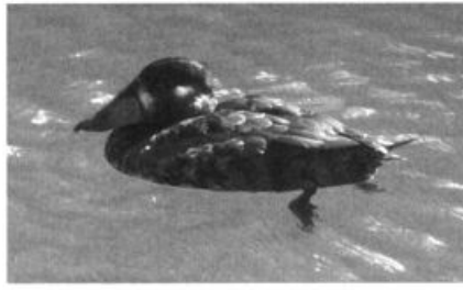
This female Surf Scoter was found in a water-filled sand mine at Kawaiele on Kaua'i 22 November 2003 after a period of strong north-northeasterly winds.