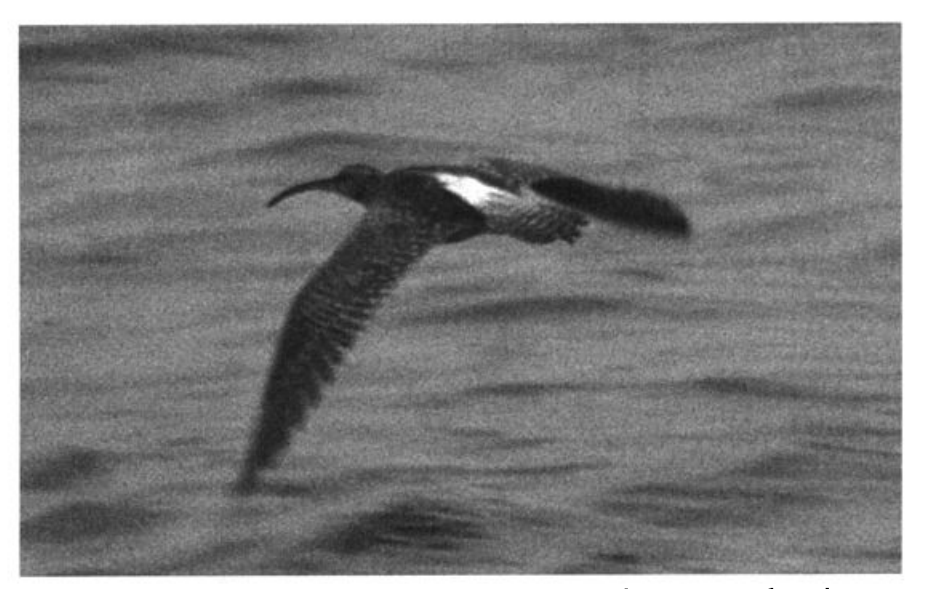
This Eurasian Whimbrel at Petit-Terre Reserve on Guadeloupe 15 November 2003 was one of several observed in the New World this autumn, including single birds in Connecticut, North Carolina, and Virginia, plus two in Nova Scotia.

Nov at Barbados (EM); and 3 were netted at s. Eleuthera 5 Nov (DC, IM, ZM), where a Tennessee Warbler 21 Nov and single Magnolia Warblers 28 Oct (JW, DC) and 21 Nov (DC, IM, ZM) were other banding highlights. A Kentucky Warbler first seen 22 Nov at Elbow Cay, Abaco remained through the period (BW).