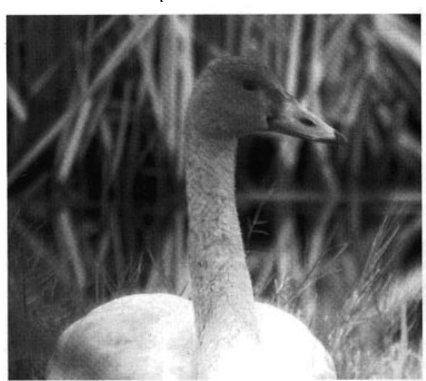
Bermuda's fourth record of Tundra Swan was furnished by this immature 16 (here) through 30 November 2003 at Cloverdale Pond and vicinity.

Tropical Storm Mindy apparently grounded shorebirds at Haiti, where JRC counted 37 American Golden-Plovers 11 Oct, with one remaining there until 1 Nov along with 15–20 Black-bellied Plovers. A probable Pacific Golden-Plover was at the Bermuda Airport 26–27 Aug (PW); photographs and descriptions are under review. The island has but one previous record. Two