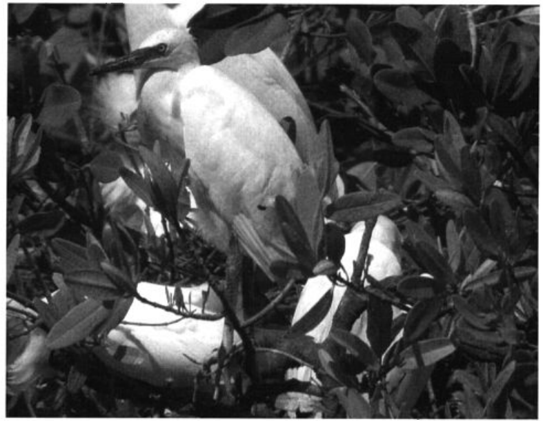
This Little Egret nestling was photographed at Graeme Hall Swamp Sanctuary, Barbados 23 November 2003. The New World status of this species is documented in a recent article in Birding magazine (36: 52-62).

released (JM). Neotropic Cormorants numbered 54 at Paradise I. Golf Course and Lakeview Ponds, New Providence, Bahamas 6 Oct (SB, LG, DM, TW). One was reported from Trou Caiman, Haïti 11 Oct, the first record from that location (IRC). An American Bittern was at Pembroke Marsh, Bermuda 4 Nov (SR), while the first of the season's Least Bitterns was at the same location 8 Nov (AD). A downy Little Egret chick was photographed at Graeme Hall Swamp, Barbados 23 Oct, a rather late date (RH). A juv. Reddish Egret was noted at Reef Golf Course, Grand Bahama 28 Sep (BH). At Trou Caiman, Haïti, 80+