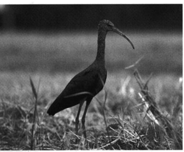
A Glossy Ibis at Saint-François Aerodrome, Guadeloupe 13-19 October (here 17 October) 2003 provided that island's second record; the species is very scarce in the Lesser Antilles.