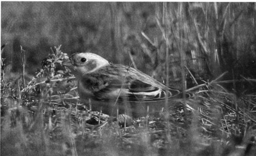
Remarkable was the Southern Pacific Coast region's third-ever Snow Bunting, which appeared 15 November 2003 on San Clemente Island (here 22 November) and remained through the winter, the southernmost record of the species on the Pacific Coast.