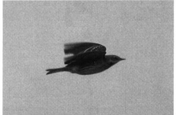
A large invasion of Red-throated Pipits occurred along the Pacific Coast during fall 2003. This bird on San Clemente Island 25 October was one of at least 17 noted there this season, part of the largest invasion of this species into southern California since 1991. This flight shot nicely illustrates the species' short and square-tipped wing shape and short-tailed flight profile.

Band-tailed Pigeons were more widespread than usual, with individuals at unexpected localities such as Avalon on Santa Catalina I. 7 Oct (BED), near Cantil, Kern 30 Sep (TMcG), G.H.P. 25–29 Oct (T&JH), Niland, Imperial 20 Nov (GMcC), and at nearby