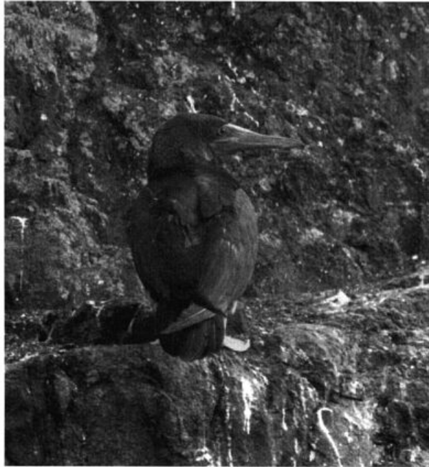
This Brown Booby on Anacapa Island, California 25 October 2003 was one of two reported in the Southern Pacific Coast region this season.

An ad. Masked Booby remained on San Clemente I. 10 Aug+ (ph. BLS), while single Brown Boobies were at Anacapa I. 25 Oct (TMcG, MJSanM) and San Clemente I. 1–3 Nov (ph. BLS). A dark-morph Red-footed Booby, the 15th in California waters, landed on a research vessel near Anacapa I. 17 Oct (CR) and remained with the vessel for three days. An Anhinga near Seeley, Imperial 8 Nov+ (JCS, GMcC) appeared to be a differ-