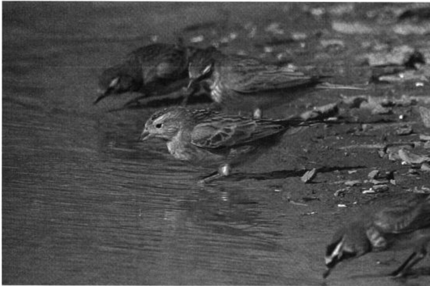
This male McCown's Longspur present 22 through (here) 23 November 2003 on San Clemente Island, California was one of two found there this fall. San Clemente's two previous records come the past two fall seasons.