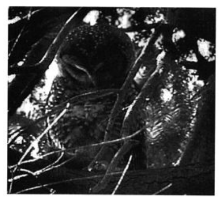
This Spotted Owl at Jericho Park, Vancouver, British Columbia 30 September 2003 is one of perhaps 10 that remain in Canada.

Whse. sewage lagoons 24–27 Oct (CD, HG). Juvenile Ruffs included singles at Boundary Bay 13 Sep (MTo, STo) and Courtenay 22–26 Sep (AM, NM et al.). As Northern Fulmars were washing ashore, small numbers of Red Phalaropes were in inshore waters, with one at Tofino's airport 19 Oct, 3 at Tofino 20 Oct, and 4 at Long Beach 22 Oct (AD). S. Yukon also enjoyed juv. Red Phalaropes at the Whse. sewage lagoons, where rare, with 2 there 12 Sep (CE), 3 there 1 Oct (CE, HG), and 2 lingering to 3 Oct (HG).