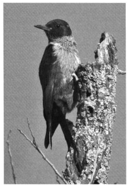
Lewis's Woodpeckers are regular winter wanderers to western Texas in the fall and winter. This individual made its way eastward to Balcones Canyonlands National Wildlife Refuge, Travis County 25 (here 28) November 2003.

Valentine, Jeff Davis 10 Aug (CEa) and in Alpine, Brewster 25 Oct (JK). The White-eared Hummingbirds found in the Chisos Mts. remained until 31 Aug (m. ob.). The female White-eared Hummingbird in the Davis Mts. was last seen 1 Sep (M&ME). Two Buff-bellied Hummingbirds finally departed Chappell Hill, Washington 11 Oct (MEf), after having been present there since spring 2002. An apparent female Lucifer Hummingbird was videotaped at Kingsland, Llano 5 Sep (DB).