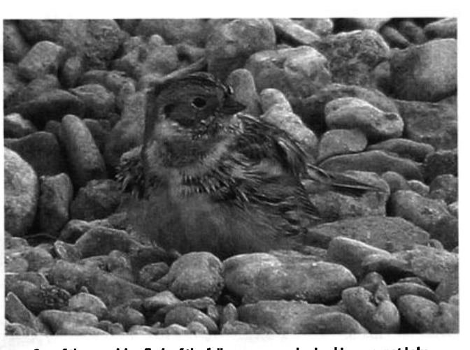
One of the surprising finds of the fall season was a Lapland Longspur at Lake Benbrook, Tarrant County 7 October 2003: this species is normally not expected in Texas before mid-November.