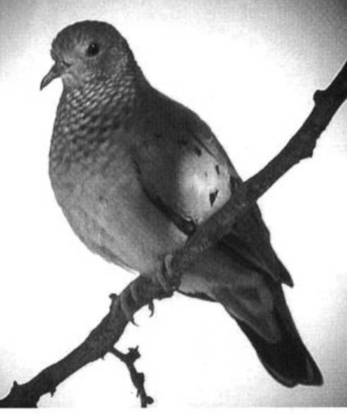
Common Ground-Dove is a very rare visitor to the northern third of Texas. This immature bird, discovered in eastern Parker County 23 October 2003, provided one of the very few well-documented records from the area (and a county first).

Details of a Short-tailed Hawk reported near San Marcos, Hays 20 Nov (†BA) will be reviewed by the T.B.R.C. A high count of 1608 Swainson's Hawks was made in Nolan 6 Oct (BFr). Well n. of its normal range was a White-tailed Hawk near New Braunfels, Guadalupe 10-18 Oct (BN, GSc et al.). A Zone-tailed Hawk lingered through the season in sw. Bandera (MiH), where the species is very rare after Sep. Single Ferruginous Hawks were reported on 5 & 18 Oct at Smith Pt., Chambers (Smith Pt. Hawkwatch staff). A Crested Caracara at Lake O' the Pines, Marion 27 Sep (BMe) is the first reported from the Pineywoods. An early American Kestrel