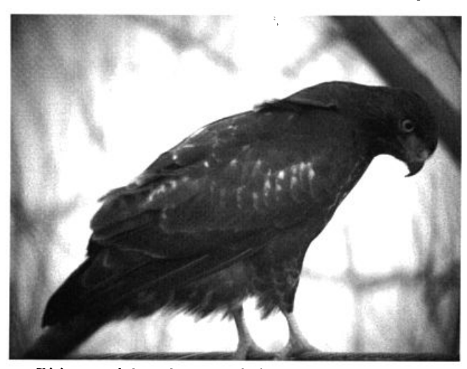
This immature dark-morph Western Red-tailed Hawk (subspecies calurus) at Gatineau, Québec 24 November 2003 appears to represent the northernmost record of this form in the North American East at this season.