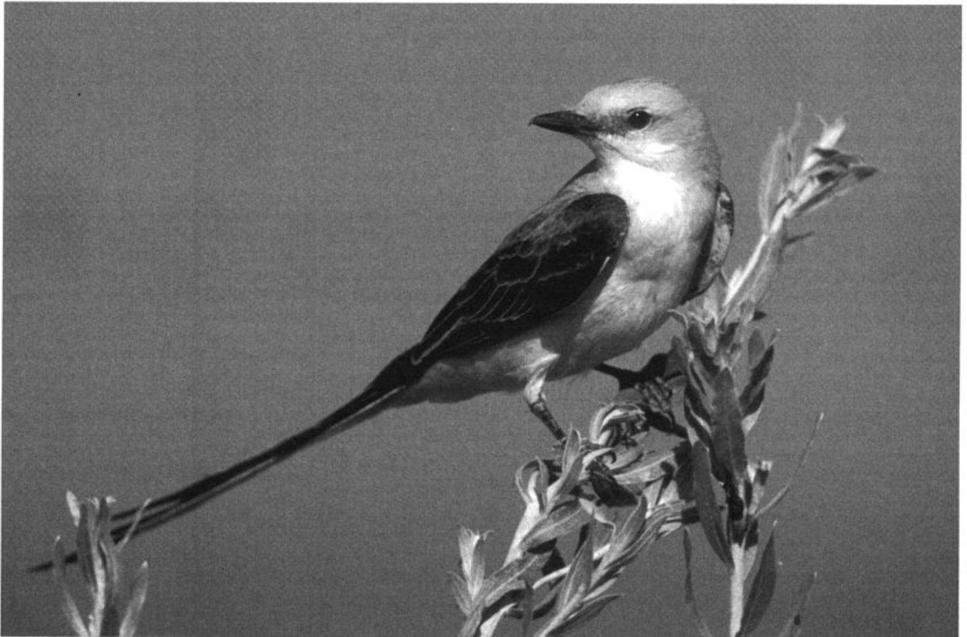
Only the second recorded in the Salton Sink in California, this Scissor-tailed Flycatcher frequented Fig Lagoon near Seeley, Imperial County 15–18 (here 16) June 2003.

Breeding Orange-crowned Warblers continued their expansion into landscaped urban parks and residential areas in coastal Orange (DRW, RAE); a juv. in Calipatria, Imperial 29 Jun (BM) had dispersed well away from breeding areas. Up to 4 Lucy's Warblers at C.L. 21–31 Jul (SSt) were presumably fall migrants, as was a very early coastal bird in Palos Verdes Estates, Los Angeles 13 Jul (KGL). Spring vagrancy of Northern Parulas continued well into the summer, with one in Carpinteria, Santa Barbara 15 Jun (DMC), 2 singing males at V.A.F.B. 16–17 Jun (DMC, MAH), one at S.F.K.R.P. 21 Jun (AS), a singing male near Pasadena, Los Angeles 24–25 Jun (CMcG, JF), and a singing male in Long Beach, Los Angeles 27 Jun (KGL). A Magnolia Warbler was found dead in Blythe 15 Jun (RH), and one was at G.H.P. 25 Jun (KSG). A Grace's Warbler at Buckhorn Campground, Los Angeles 14 Jun (JF) was the first to be found in the San Gabriel Mts. in summer. A male Blackpoll Warbler in