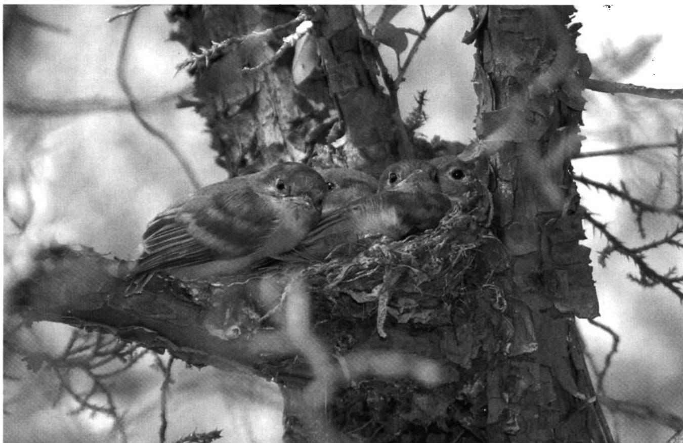
A pair of Buff-breasted Flycatchers returned for the fifth consecutive year to the central Davis Mountains of Texas. The same territory was occupied as in previous years and for the fourth time successfully fledged young. These four nestlings were photographed on 26 June 2003, just prior to leaving the nest.

was noted on Fort Hood, Coryell 17 Jun (DCi). Of great interest was a singing Yellow Warbler along the Canadian R. in Hemphill 30 Jun–5 Jul (TE); there are no recent breeding records for Texas. Late Yellow Warblers included 2 at Quintana, Brazoria 7 Jun (DVe); another detected on w. Galveston I. 30 Jun could have been either early or late (JSt). Other interesting Yellow Warbler records included an ad. male in Midland 12–13 Jun (D&JM) and a singing male in Bexar 18 Jun (BDo). A lingering Magnolia Warbler was in Richardson, Dallas 18 Jun (RC). Black-throated Green Warblers are found during the summer almost annually; this year, singles were near Uteley, Bastrop (BFR) and at High I., Galveston 7 Jun (DVe). More unexpected was a Black-throated Green Warbler in Bandera 29 Jun (TGa). A hatch-year male Golden-cheeked Warbler was photographed in the Chisos Mts. 29 Jun (†ML), providing the first fully-documented record for the Trans-Pecos. A possible Golden-cheeked Warbler was reported at the Woodlands, Harris 27 Jul (NA). Blackburnian Warbler is a good find in the Trans-Pecos at any time, but one in Big Bend's Pine Canyon 2 Jun (BPe) was a remarkable find.