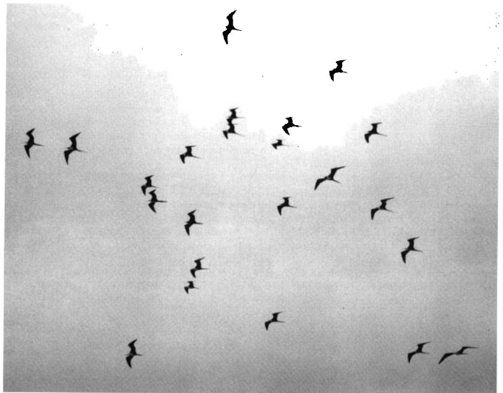
Spectacular numbers of Magnificent Frigatebirds were counted along the Coastal Bend of Texas after Hurricane Claudette made landfall on 15 June 2003. Groups exceeding 50 birds, such as this one along Mustang Island 15 June, were seen at several locations.

Unexpected in summer on the South Plains, a Sharp-shinned Hawk was in Yellowhouse Canyon, Lubbock 19 Jul (RK, NW). More expected, but still nice finds, were 3 Sharp-shinned Hawks in the upper