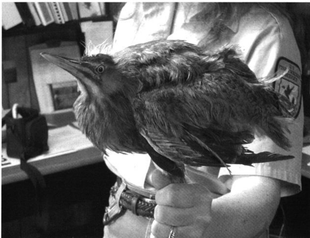
American Bittern is a very rare nester in Texas, and this juvenile found at Anahuac National Wildlife Refuge on 6 June 2003 provided the first evidence of breeding on the Upper Texas Coast in more than 60 years.

Northern Bobwhites apparently had a good year on the U.T.C., as they were noted frequently at Brazoria N.W.R., Brazoria (RWe et al.) and in Waller (FC). A calling King Rail at Balmorhea L. 6 Jun (BPe) provided a very rare Trans-Pecos record. A Virginia Rail calling at Rita