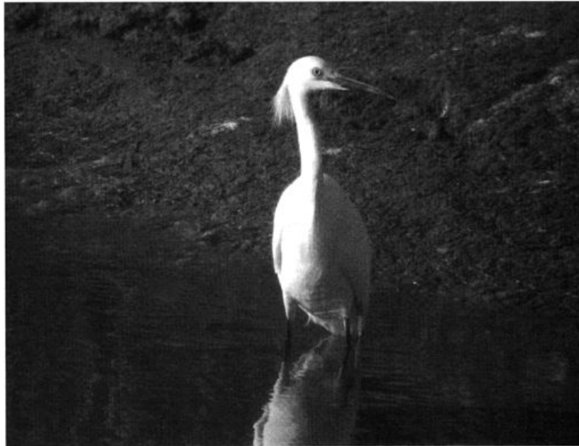
This Snowy Egret was one of at least three present at Whitewater Lake, Manitoba during the summer (here 20 June 2003).

fledged from 200 boxes in the Good Spirit L. area (B&JA) and another 150+ were raised from 84 boxes near Abernethy (RB). A Wood Thrush in the Cottonwood/Wascana Creek Valley 14–16 Jun was about the 20th for Saskatchewan (TH, BL, SA, m. ob.). Manitoba had 3 Northern Mockingbirds, one was near