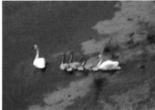
Aerial surveys during the summer of 2003 in Riding Mountain National Park, Manitoba revealed several breeding pairs of Trumpeter Swan, including this one with young in August. The last confirmed nesting in the province occurred about a century ago.

Saskatchewan, with 10+ nesting along the Souris R., up to 8 in the Qu'Appelle Valley, and 5 in the Good Spirit L. area (BL, B&JA). Mountain Bluebirds also had a stellar year in Saskatchewan, as 500+