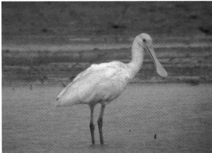
This Roseate Spoonbill at Vandalla, Fayette County, Illinois remained there from 22 June (here 25 June) to 8 July 2003, but spent 14 July through mid-August at nearby Carlyle Lake.

sippi Kites returned to established breeding sites in both states. Extralimital kites were reported in Rockford, IL 9 Jul (BW) and at Brussels Ferry, Jersey , IL 20 Jul (BR). The only breeding Broad-winged Hawk reports consisted of a nest and fledgling at Woodstock, IL 9 May–27 Jun (DF) and a nest in Palos, IL (success not determined) 10 May–1 Jul (WSS, EWW). Illinois's resident Swainson's Hawks constructed three nests in Kane and two in McHenry ; however, only one nest proved successful, fledging 2 young (RMO). The only reports of the ne. Illinois Gray Partridge population consisted of a female in Lee 26 Jul (CMc) and two pairs in De Kalb 6 May (DSh).