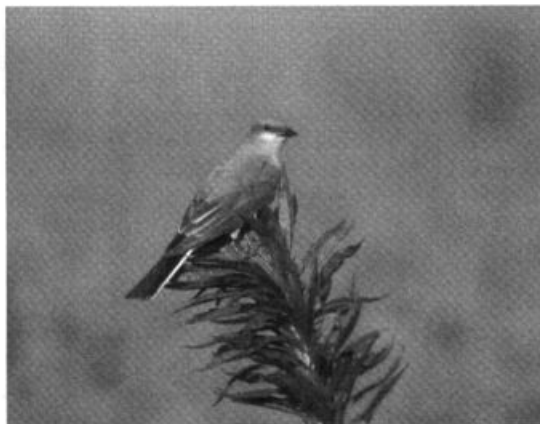
A rare breeder in Illinois, Western Kingbird was documented nesting for the first time in southern Indiana in Vanderburgh County 29 June (here) to 4 July 2003, with adults carrying food to the nest regularly at this time.