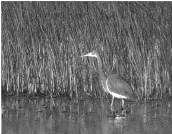
A summer rarity in the Midwest, this Tricolored Heron was found at the hotspot Kankakee Sands in Newton County, Illinois, here 9 June 2003.

sion continued this summer, with 20 birds reported at 12 Illinois locations and 4 at three Indiana locations, including