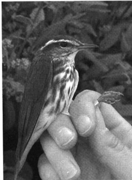
Banders at Big Sur Ornithology Lab, Monterey County, California captured this Louisiana Waterthrush 30 May 2003, only the second record for the Region.