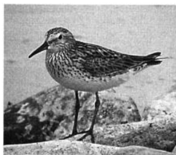
White-rumped Sandpipers are rarely found in the Great Basin Region. This remarkable photograph was taken at the Blanding sewage ponds, San Juan County, Utah on 27 May 2003.