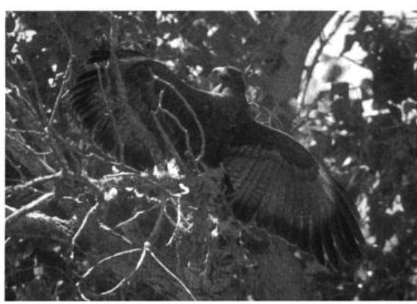
A pair of Common Black-Hawks returned to the same cottonwood grove at Rio Grande Village in Big Bend National Park for the eighth consecutive year. The hawks were first seen 13 March 2003, and nesting activities were noted by early April. The male was generally the more easily observable of the pair (here 12 April).

m. ob.) provided a rare local record. A Sandhill Crane lingered at Lubbock to the very late date of 28 May (JTS et al.) Two Whooping Cranes were noted during their brief stopover at Stillhouse Hollow L., Bell 11 Apr (RPi).