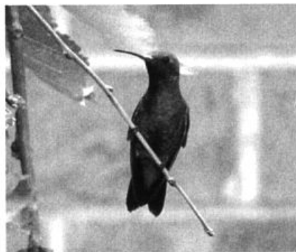
Quite a surprise was this Broad-billed Hummingbird 15 May 2003 south of Durham, Roger Mills County, Oklahoma. It provided the second record for the Region, although a remote possibility exists that it was the same bird as found into January 2003 in southwestern Oklahoma.

Few Blue-winged Warblers were found, those being in Knox , NE 24 May (MB), Wyandotte , KS 11 May (CW), and Cherokee ,