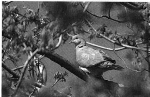
Manitoba added Eurasian Collared-Dove to its list when this bird showed up in Holland in early May 2003. Seen by many birders on 12 May, the day of this image, it apparently was gone a day later.