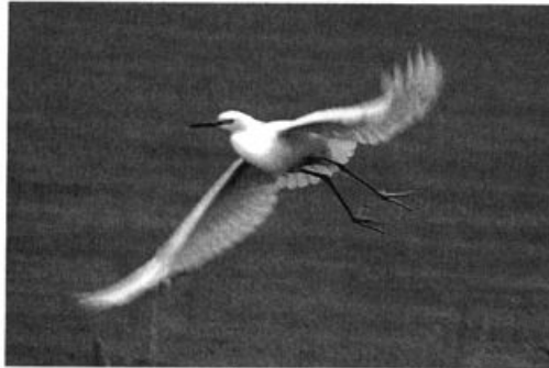
From mid-May 2003 onward, Whitewater Lake in southwestern Manitoba hosted numerous "southern" waders, as did many northern locations this spring. This Snowy Egret, photographed here 19 May 2003, was one of at least two present.