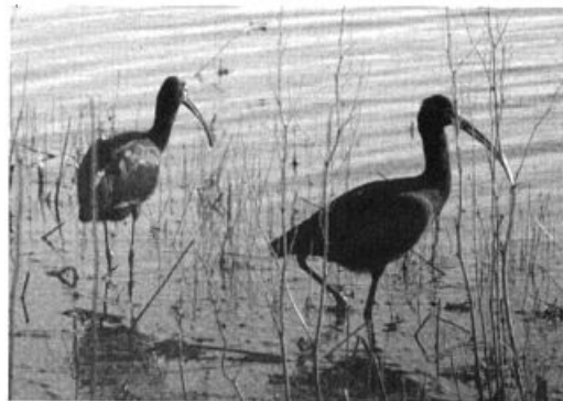
With at least five White-faced Ibis present this spring at Whitewater Lake, Manitoba, there was hope that the species would remain to breed at this productive marsh. These two birds were photographed 19 May 2003.