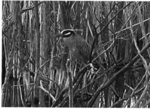
This obliging Yellow-crowned Night-Heron, locally extremely rare, frequented Oak Hammock Marsh W.M.A., Manitoba from 22 May (here 24 May) into June 2003.