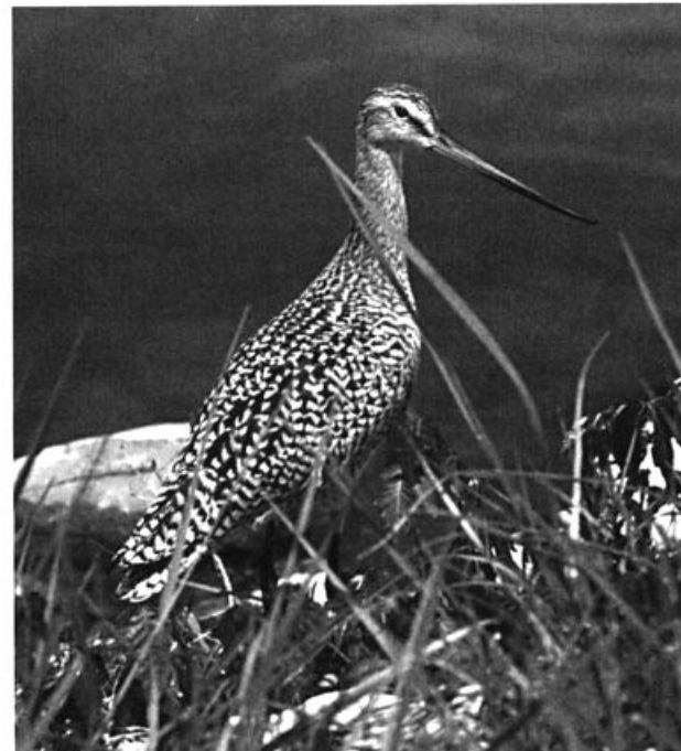
This Marbled Godwit in Rowan County, Kentucky 26 April 2003 was the easternmost of several spring records in the Tennessee & Kentucky Region.

years. A Philadelphia Vireo heard and seen in Calloway, KY 23 Apr was exceptionally early (KCo).