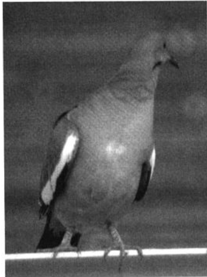
This White-winged Dove in Fulton County 6–7 May 2003 was Kentucky's third and the Region's fifth.