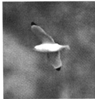
Black-legged Kittiwakes are very rare in the Tennessee & Kentucky Region, but this adult bird at South Holston L., Tennessee 19 April 2003 was doubly exceptional: it furnished a Region-first spring record, and it is one of only a few adult birds ever documented in the Region.

May (MT) are evidence of that species' continuing expansion in Tennessee. A few Le Conte's Sparrows lingered in both states through at least 8 Apr. A male Painted Bunting on territory in w. Fulton 30 Apr–31 May+ represents the first fully-documented record for Kentucky (ph. BPB, ph. MM, m. ob.); another in Hamilton, TN 4–17 Apr (MF, m. ob.) furnished a 3rd county record. A Dickcissel in Wynnburg, Lake, TN 1 Mar (NM, JRW) may have wintered.