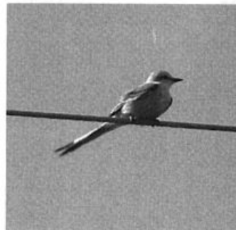
Scissor-tailed Flycatchers are now annual breeders in the Tennessee & Kentucky Region, though this lone female in Fulton County, Kentucky 12 May 2003 appeared to be a transient.

A Least Flycatcher and a Yellow-bellied Flycatcher along Walnut Log Rd., Obion , TN 25 May (JRW et al.) were relatively late for Tennessee. Western Kingbirds continued their expansion at Ensley , with at least 5 ads. and two nests observed 17–31 May+ (ph. JRW). Scissor-tailed Flycatchers continue to increase in the Region. Kentucky saw reports of one to 2 birds in no fewer than five locations. A bird found in Bourbon in the n.-cen. part of the state 27 Apr (ph. G&NE) turned out to be the male of a pair