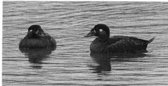
These Surf Scoters in Boone County, Kentucky 18 April 2003 were part of a modest spring movement through the Tennessee & Kentucky Region.