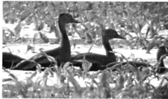
Whistling-ducks, scarce vagrants to Tennessee, put on quite a show in northwestern Tennessee in spring 2003. Up to 11 Black-bellied Whistling-Ducks, including those shown here, were seen regularly at several locations in Lake County and Dyer County 10–31 May 2003 and into June. Up to 9 Fulvous Whistling-Ducks were also found in Dyer County 25 May and later.