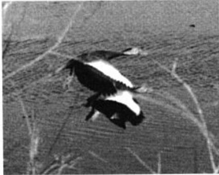
A pair of Black-bellied Whistling-Ducks was discovered during the Audubon Society of Missouri's spring meeting at Squaw Creek N.W.R. on 26 April 2003.