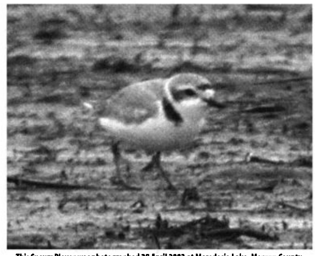
This Snowy Plover was photographed 28 April 2003 at Meredosia Lake, Morgan County, Illinois. This constitutes the fifth Illinois spring record; all spring birds have been found within the two-week interval 27 April to 11 May.

Grant Park (DFS) provided a record count for Illinois. Harris's Sparrows were confined to Illinois, where 3 were reported. Peak longspur counts included 1000 Laplands in McLean , IL 30 Mar (MLR) and 200 Smith's in Montgomery , IN 14 Apr (CCM). Few Snow Buntings were reported; the peak count was 50 in St. Joseph , IN 3 Mar