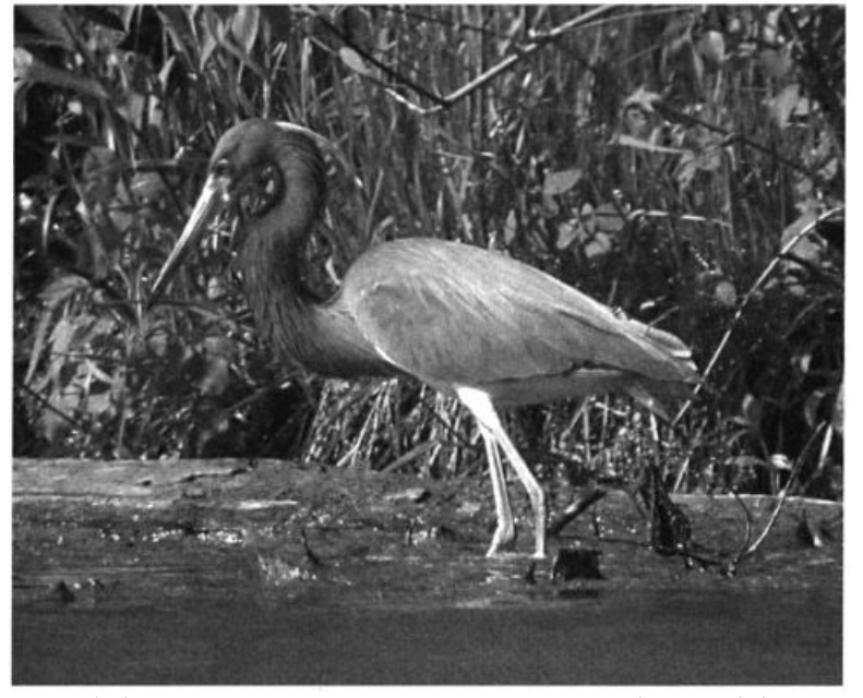
This Tricolored Heron was photographed 20 May 2003 at Homer Lake, Champaign County, Illinois. This species seemed to be on the move north through the interior of the continent this spring.

with an early arrival in Chicago's Grant Park 4 Apr (DFS) and a peak tally of 53 in Jax. P. 10 May (SLC et al.). An impressive 1380 White-throated Sparrows 1 May in Chicago's