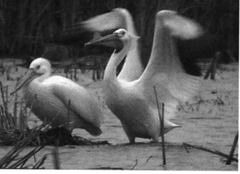
These are two of three American White Pelican present 7 April 2003 at Willow Slough Federal Wildlife Area's J. C. Murphey Lake. The next day, the number had grown to a state-record 52 birds.