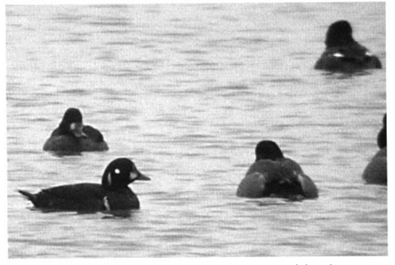
A male Harlequin Duck was found 3 March 2003 in Hammond, Indiana on Lake Michigan, where rare.

Apr (†EPo) and another at Chicago's Soldier Field 13 May (†DFS, †TSS, DEW, GAW). On Chicago's s. side, Monk Parakeets strengthened their stronghold, with 125 birds, plus 28 huge nests, observed at