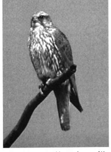
A juvenile gray-morph Gyrfalcon was documented 22 March (here 23 March) to 5 April 2003 at Kankakee Federal Wildlife Area, Indiana, a first state record.

17-18 May (DMK); and first-year Lesser а Black-backed at Montrose 18 May (AFS). This spring, a D.N.R. survey revealed that Caspian Terns again nested at the East Chicago, IN steel mills: a 27 May count revealed 146 nests, many containing up to 3 chicks This spring, (JSC). Common Terns were more prevalent than normal; the peak tally was 1000 at Waukegon 15 May (KAM). Also quite impressive was a count of 80 Least Terns at an inland se. Massac, IL site 31 May (VMK). Black Terns peaked at Carl. L. 13 May, when counted 65 were (KAM).