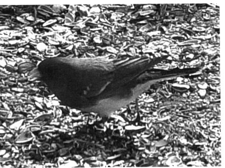
This Slate-colored Junco showed up at a feeder in Yardley, Bucks County, Pennsylvania 10 March 2003 (here). A small percentage of Slate-colored Juncos can show distinct white wingbars similar to those in the race aikeni (White-winged Junco). Such birds can be identified as Slate-colored by their smaller size, darker gray coloration, especially on the throat, and less white in the tail.

vania hawkwatch stations included 137 birds at Rose Tree Park, Media, PA, 135 at Tussey Mt., Bedford, and 132 at Allegheny Front, Somerset/Bedford. An ad. Mississippi Kite wandered n. to Bern Twp., Berks, PA 28 Apr (J. Silagy), and an imm. was near L. Ontelaunee 17 May (KK). Bald Eagle numbers continue to increase across the Region, topped by 16 birds visible at one time at Metzger Marsh W.A., Lucas, OH 1 Apr (VF). In an exceptional flight, 97 Redshouldered and 215 Red-tailed Hawks were listed at Maumee Bay S.P., OH 16 Mar (VF). Early Broad-winged Hawks were in Summers, WV 1 Apr (JPh) and at P.N.R. 3 Apr (ML). A Swainson's Hawk spotted at Tussey Mt. hawkwatch 20 Apr (ML) established what was apparently just the 3rd Pennsylvania spring record. The 199 Golden Eagles that passed Tussey Mt., PA (32 of them on 16 Mar alone) established a record spring total for an e. U.S. hawkwatch (fide GG); in yet another exceptional spring count, 124 Golden Eagles passed by Allegheny Front.