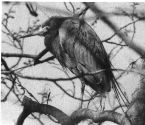
Rare in Ontario at any season, this Little Blue Heron was south of Sparrow Field, Point Pelee 13 May 2003.

It was a good spring for people wishing to hear Yellow Rails in s. Ontario. Up to 6 were at the Wylie Road marsh, Kawartha Lakes during May (m. ob.), and single birds were