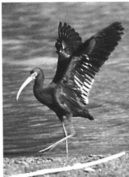
Continuing its decade-long expansion, White-faced Ibis was reported well out of range in many places this spring. This bird was found 4 May 2003 but first identified as a White-faced at Sturgeon Creek, Ontario 5 May.

Ontario was one banded at T.C.B.O. 29 May (T.C.B.O.). Record early were a Mourning Warbler at Pelee 5 May (JDL) and a Hooded Warbler there 9 Apr (AW). Up to 18 Summer Tanagers were seen 30 Apr–23 May, with most occurring at Pelee, but with several at each of Long Pt. and Pelee I. (m. ob.).