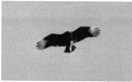
This Black Vulture in the lighthouse area of Presqu'île Provincial Park, Ontario 1 December 2002 provided the fourth Northumberland record—ever.

counts gave similar results. The West Nile virus was the cause of the decline without a doubt. Away from the urban L. Ontario corridor, counts were normal, even high for these species. However, there were problems elsewhere. The Tufted Titmouse count was only one on the Cedar Creek C.B.C. vs. 21 the year before, and the Wallaceburg C.B.C. turned up only 19 vs. 69 in 2001. The 2 Carolina Wrens on the Ottawa C.B.C. 15 Dec were