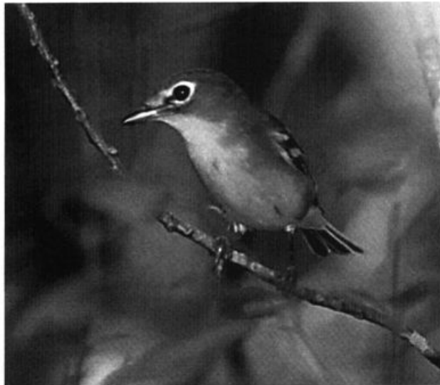
Grand Cayman's first Blue-headed Vireo was this bird, found 30 October 2002.

Cayman (NN, TB), with as many as 4 recorded 14 Nov. Two Swainson's Warblers were seen at Shannon Golf Course, Grand Bahama 14 Nov and one at Lucaya National Park there 20 Nov (BH, GB, JVH). At least 10 Swainson's were seen at various location at Bermuda during the fall, a