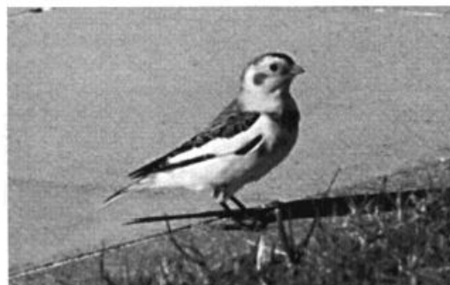
Though scarce at this latitude on the North American mainland, Snow Bunting is an annual, sometimes numerous late fall and winter visitor to Bermuda, where often found around the airport. This bird was at the Royal Naval Dockyard 15 November 2002.