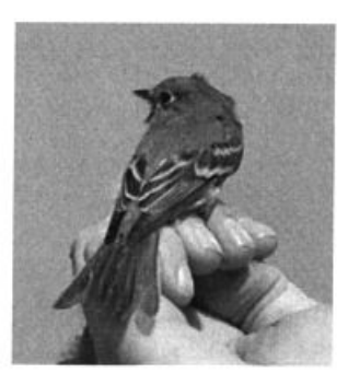
This Alder Flycatcher on Southeast Farallon Island 25 October to 2 November 2002 was the Island's second and second for the Region.