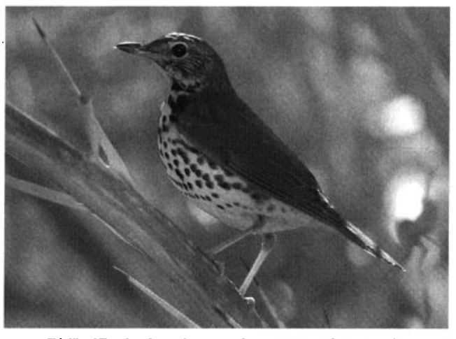
This Wood Thrush at Boyce Thompson Arboretum State Park near Superior, Arizona 20 October to 3 November 2002 (here 27 October) furnished one of about 20 records for Arizona.