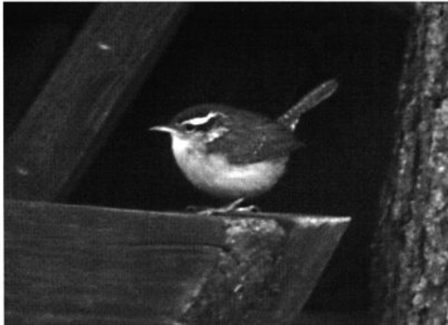
The second documented record for North Dakota, this Carolina Wren appeared at a Bismarck feeder in early November 2002 (here 11 November) and was still present at the end of the period.

(CC). Furnishing the latest reports for South Dakota, a Rock Wren was in Meade 20 Oct (REP), and a Sedge Wren was noted in Yankton 11 Nov (DS). A Carolina Wren