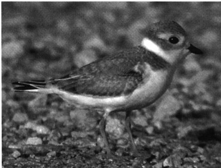
Away from Lake Michigan, Piping Plovers are quite rare in the Illinois & Indiana Region. This juvenile found at Hurshtown Reservoir 16 August 2002 was one of two found in Allen County, Indiana this fall.

PBG) and Madison, IL 29 Nov (CML). A first-year Iceland Gull at Winthrop Harbor, IL 30 Nov (AFS) provided the season's only report. The Lesser Black-backed Gull continues to expand, with 10 birds reported in Illinois and 9 in Indiana. It was a good fall for Black-