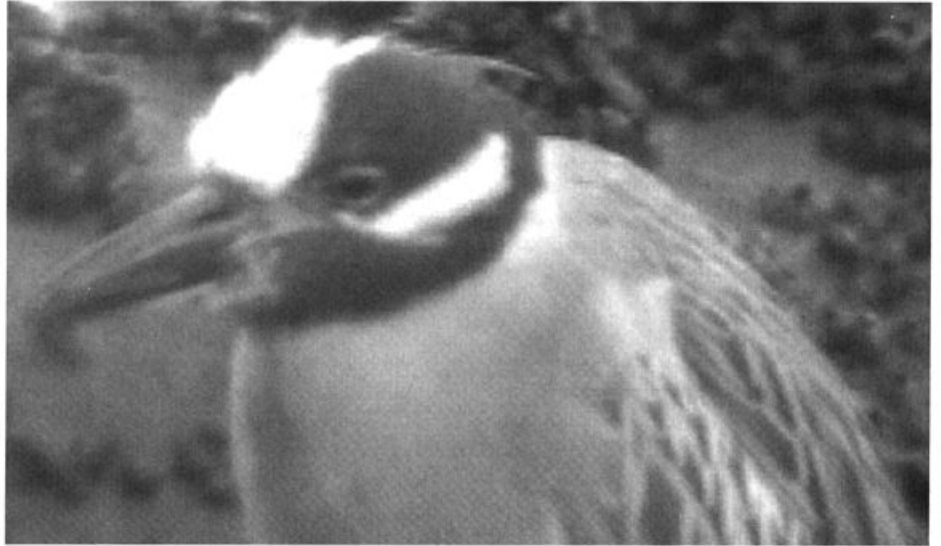
This cooperative Yellow-crowned Night-Heron, only the third for the Region, was enjoyed by many at Coyote Point, San Mateo County 23-24 July (here 23 July) 2002.

A tantalizing sighting of a Lewis's Woodpecker at Los Vaqueros Res. 7 Jun unfortunately pertained to a late migrant rather than a nester; there are no breeding records for Contra Costa (SAG). A pair of Western Wood-Pewees with a fledgling at Mt. Davidson 4-9 Jul strongly suggests that breeding occurred, but this has yet to be proven in S.F. (PSa). As is typical, a smattering of Willow Flycatchers was detected along the coast during the first two weeks of Jun, but surprising were single unseasonal birds at Coyote Pt., San Mateo 25 Jul (RSTh) and C.C.F.S., Santa Clara 28 Jul ( vide MMR). Encouraging news for this beleaguered species included a female with an egg in its oviduct at the Van Duzen R. mouth as well as at least 4 territorial males throughout the period along the lower Van Duzen, Eel, and Mad Rivers (all Humboldt ; RHw, LBJ Enterprises). Other unusual Empidonax included a vagrant Least Flycatcher at