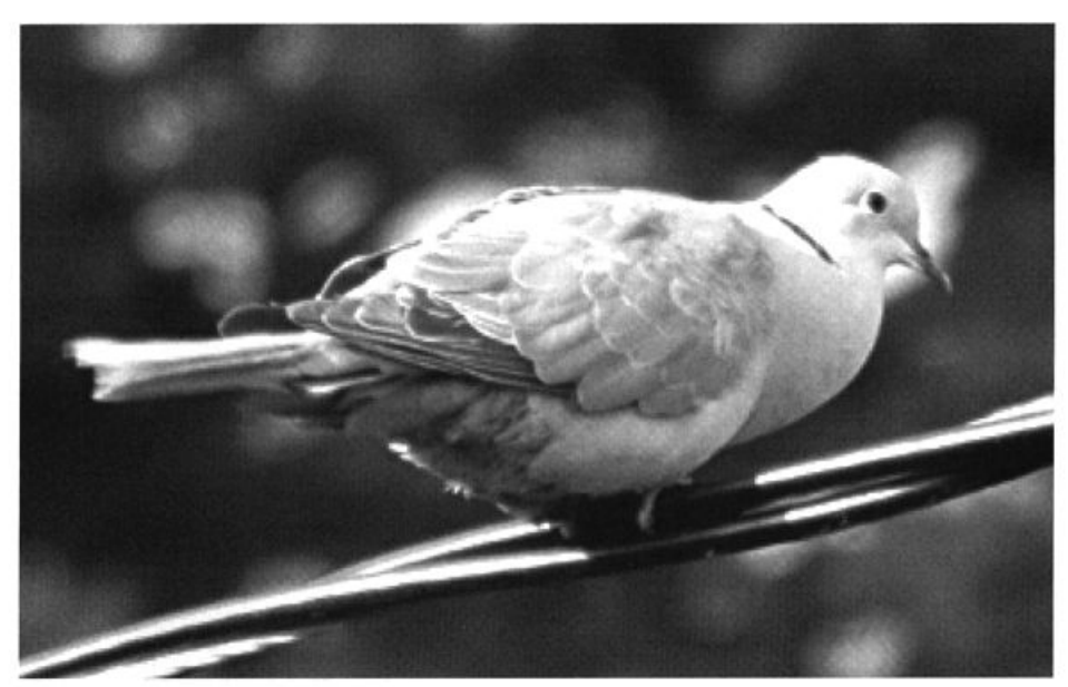
A Eurasian Collared-Dove at Hamlin Beach, Monroe County, New York 8 June—29 July 2002 constituted the first New York record away from Long Island.

of the costs of colonial densities. A growing form of human disturbance is kayakers, many of whom approach with long lenses. One wonders, too, about the agricultural and industrial pollution so visible along Delaware Bay. Finally, such a colony generates its own natural succession, as bird droppings kill off essential vegetation. The Highbush Blueberry in which Cattle Egrets, Glossy Ibis, and Blackcrowned Night Herons once nested died out by 1999, and the Phragmites may have become too thick for them, while the taller Pin Oaks and Black Gums preferred by Great Blue Herons and Great Egrets remain (Rob Line, D. N. R. E. C.).