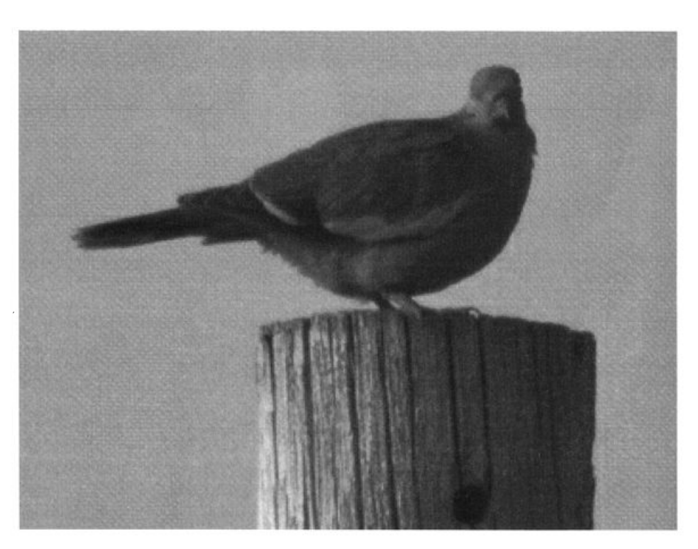
This White-winged Dove remained at Hamlin Beach, Monroe County, New York 8-18 June 2002. The species has become an almost annual visitor to New York since the early 1990s.

SA There were still 29,000 shore-birds—mostly Sanderlings, Ruddy Turnstones, Red Knots and Semipalmated Sandpipers-at the great Delaware Bay staging ground when the last aerial survey was taken 5 Jun. The peak of 157,000 28 May was about 25% below normal. Semipalmated Sandpipers were particularly reduced, peaking at 50,000 compared to 190,000 last year. Maximum counts of Red Knot (31,700) and Ruddy Turnstone (64,700) were also down. Red Knots are particularly significant because about 80% of the East Coast population stops here in spring; the relatively low weight of banded Red Knots this spring added concern. Only Sanderlings held up: their peak of 14,000 23 May was average. Careful water analysis shows that Horseshoe Crab eggs, the main resource for these shorebirds on route to the Arctic, have become fewer and more patchily distributed, forcing the birds to concentrate on a few beaches. Overharvesting Horseshoe Crabs is clearly damaging this globally significant shorebird staging area (KCl). The same is clearly true in our sister Region to the south, around Chesapeake Bay and the coastal barrier islands.