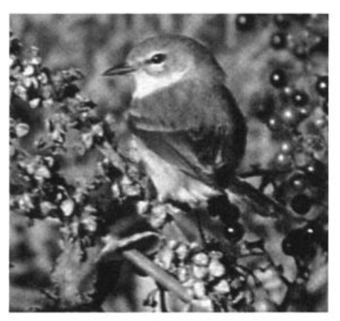
Lemon Tank's fresh water is the only source on San Clemente Island, so it's a good spot to wait for vagrants such as this Prairie Warbler, which stayed here from October through mid-December 2001.

A Northern Goshawk at C.L. 16-31 Dec (BSh) was only the 2nd in e. Kern. One Harris's Hawk was still present from the 1994 incursion at Borrego Springs, San Diego at the end of the period (RT), and another was near Warner Springs, San Diego 17 Dec (BSie). The Broadwinged Hawk that arrived on San Clemente I. 31 Oct remained through the period (BLS). A Swainson's Hawk at V.C.G.P. 25 Jan+ (WW; ph.) and another over Lake Forest, Orange 16 Dec (JEP) were evidently wintering locally, but one near El Centro, Imperial 15 Feb (KZK) was an early spring migrant followed by at least 4 more in the next two days. Single Zone-tailed Hawks were along the coast in Santa Barbara/Goleta (DMC), San Clemente/San Juan Capistrano (DRW), and Escondido (MUE) throughout the period, an imm. was in the Upper Ojai Valley, Ventura 6 Jan (BSil), an ad. (returning?) was at nearby L. Casitas 12-17 Feb (TT, DPe), one was at Laguna Niguel, Orange 29 Jan (VL), and another was near Mesa Grande, San Diego 17 Dec (BSa); farther inland, single ads. were at Blythe 1-2 Dec (RHi),