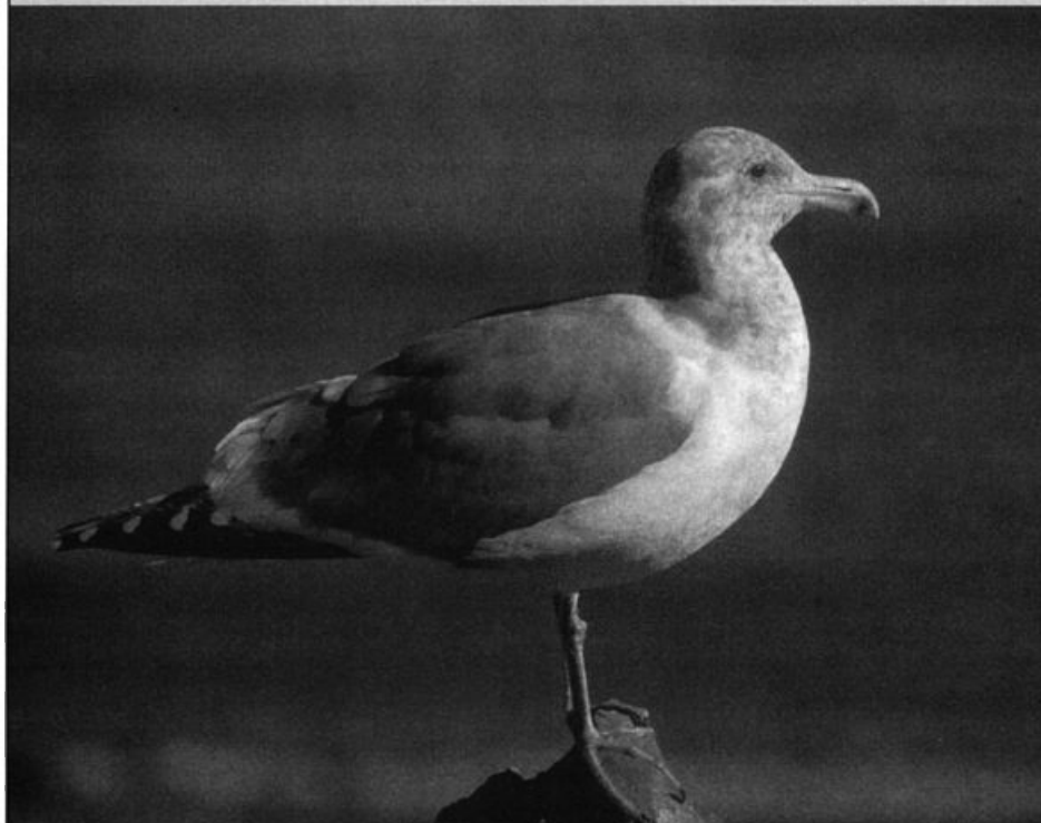
One of two “Olympic Gulls” present on Pyramid Lake, Nevada this winter (here 16 January 2002), these birds raise the broader question of the “purity” of apparent vagrant Glaucous-winged Gulls, which were noted as far afield this season as Ohio and Virginia. Are hybrids with Glaucous-winged Gull more likely to vagrate than pure Glaucous-wingeds?

SA Gulls of unquestioned Glaucous-winged Gull parentage occur every winter in the Great Basin. Most records are from the larger lakes in the northern parts of the Region, but sightings are possible anywhere. Some of these birds are obviously hybrids with Western Gulls. Others are not as obvious and have occasioned lively debate among area birders. One camp holds that almost all are hybrids (“Olympic Gulls”), while the other camp maintains that many are pure Glaucous-winged Gulls. The bird in the accompanying photograph appears to be a straightforward hybrid, but other individuals have proven more difficult (and less photogenic). Birders in Nevada and Utah are encouraged to make special note of wintering Glaucous-winged Gulls and/or “Olympic Gulls,” and to try to help shed light on the interesting phenomenon of their annual dispersal inland.