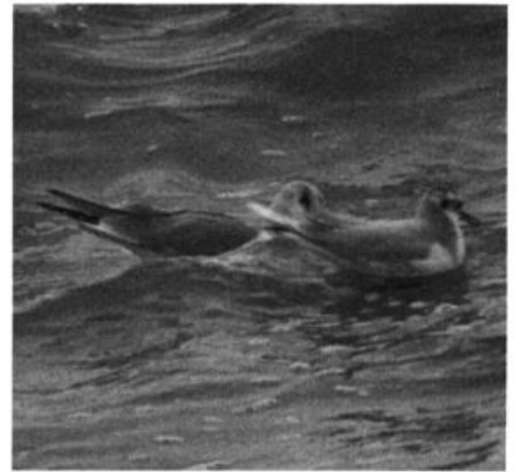
Adult Little Gull (right) with Bonaparte's Gull (left) off Antelope Island Causeway, Davis County, Utah 13 December 2001. This bird provided only the second record for Little Gull for Utah and for the Great Basin region.