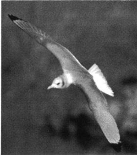
This adult Black-legged Kittiwake at Ivins Reservoir, Washington County, Utah 3–5 January 2002 afforded a second record for the state.