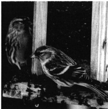
The event of the season in the Great Basin was an incursion of Common Redpolls into northern Nevada and Utah (and beyond). These males were part of a small flock that visited an Elko, Nevada feeder, here photographed 30 December 2001.