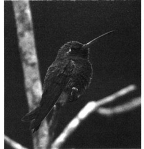
This striking male Broad-billed Hummingbird, originally discovered on 18 October 2001, spent the winter in suburban Houston, Texas. This species occurs almost annually in the state, although most often in the western half.