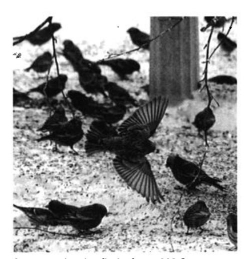
Among a wintering flock of over 600 Graycrowned Rosy-Finches at Exshaw, Alberta, there were several of the "Hepbum's" subspecies and at least one albino! This image was captured 27 February 2002.

Screech-Owl called in temperatures of -30 degrees C in Winnipeg 27 Jan (RN). After last fall's influx of Snowy Owls, a fair number remained; 43 were banded in Saskatchewan in Dec and Jan (MS, DZ, BT). Only se. Manitoba experienced a strong "echo" of last winter's Northern Hawk Owl and Great Gray Owl incursion. A Long-eared Owl was in the Swift Current, SK area 29 Dec (fide WH). Seventeen Short-eared Owls were seen in Saskatchewan (RW, CB, DH), and about 10 in Alberta, while 3 in Winnipeg 26 Jan were the only ones in Manitoba (RP, JS, AW). A female Red-bellied Woodpecker , Saskatchewan's 7th or 8th, overwintered in Regina (TR, m. ob.).