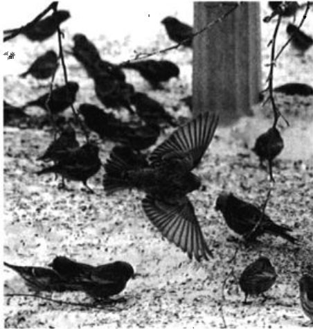
Among a wintering flock of over 600 Gray-crowned Rosy-Finches at Exshaw, Alberta, there were several of the “Hepburn’s” subspecies and at least one albino! This image was captured 27 February 2002.