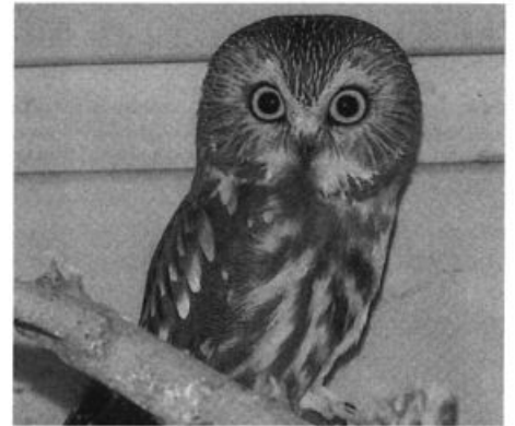
On the day after Christmas, two policemen saw a small parcel drop from a tree, having been dislodged by a passing truck at Lighthouse Point, Broward County. Their investigation revealed Florida's fourth Northern Saw-whet Owl, a dazed bird that was rehabilitated and released 28 December 2001.

The proliferation of w. hummingbirds in the Region continues to be one of the more interesting stories of recent winters. So great are the number of reports that this summary concentrates on hummingbirds banded by FB or pho-