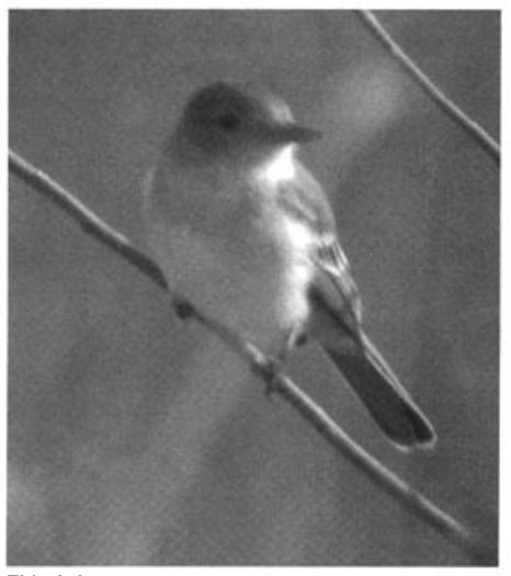
This Ash-throated Flycatcher at Alligator River N.W.R., Dare County, North Carolina was present from December through late January. Although North Carolina's sixth record, this was the most cooperative and widely studied of any in the state.

year. Purple Finches and Pine Siskins were present in many parts of the Region but showed a localized distribution. Evening Grosbeaks were still in very low numbers, with none reported in most of the Region.