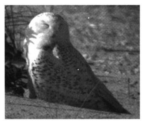
The fall and winter were the best seasons in over a decade for Snowy Owl records toward the southern extreme of its range. This bird was at Fort Fisher, North Carolina from late November through early December, frequenting a spit once used by a regularly roosting Masked Booby 20 years before.