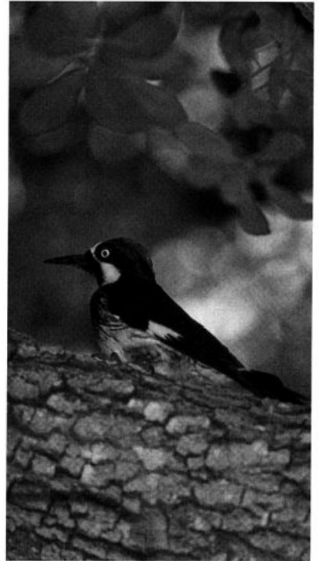
This female Acorn Woodpecker in McAllen, Texas 6-10 November 2001 provided an unexpected first record for the Lower Rio Grande Valley. The closest populations of this montane species are in the Sierra Pichacos in northeastern Mexico, about 160 km away.