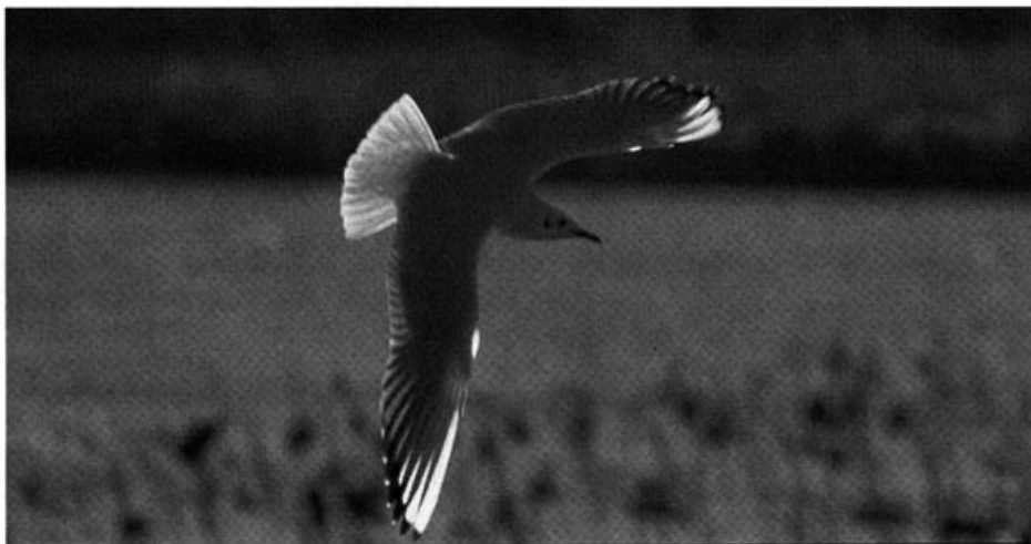
On 6 October 2001, a Black-headed Gull, a species rather rare away from northeastern coasts, turned up at Spirit Lake in Jackson County, on the Minnesota-Iowa border; this is the fourth October in a row for the species here. Birders away from the Atlantic coasts are finding the lakes and rivers in the interior productive for this and indeed virtually any gull species. This photograph was taken 24 October.