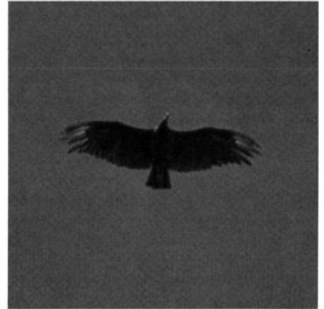
Minnesota joined the ranks of other northern tier states when this Black Vulture, a state first, flapped and sailed by the Hawk Ridge hawkwatch site at Duluth on 28 August 2001.