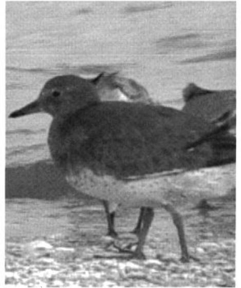
Providing only the third verifiable record for Florida (and third record for any eastern state!) was this Surfbird at Sanibel Island 26-28 October 2001 (here 27 October).

Brown's Farm Road hosted 18 Upland Sandpipers 19 Aug (CBo), while one at Fort Myers 8–9 Sep (DSu et al.) was the first there in five years. Casual in the Region was the Hudsonian Godwit at Fort Island Beach Park, Citrus 14 Sep (TR, ph.). The stunning Surfbird at Sanibel I., Lee 26–28 Oct (B&CP et al., vt. BPr, DP) represented only the 3rd Florida record and one of very few away from the w. states. Shorebirds at L. Apopka were one Red Knot 16 Sep, one Sanderling 29 Aug, one Ruff, 8 White-rumped, and 690 Pectoral Sandpipers 16 Sep, one Baird's Sandpiper 13 Sep, and 3 Buff-breasted Sandpipers 26 Sep (HR). A 2nd inland Sanderling dropped by Tram Road W.T.P., Tallahassee 13 Sep (GM), while Ft. Meade, Polk hosted another Baird's Sandpiper 20 Oct (TP). A Purple Sandpiper made it s. to Boynton Inlet 15–30 Nov+ (PB, CJG et al.), and a leucistic Dunlin was found at St. Marks 4 Nov (SD). Other Buff-breasteds were duos at Honeymoon I. 2–3 Sep (RaS et al.) and Brown's Farm Road 7 Sep (KA et al.), and singles at Tram Road W.T.P. 17 Oct (JC), n. of Bakersville 30 Sep (JHi, LD), and w. of St. Augustine 29–30 Sep (LD). Very early were 2 Long-billed Dowitchers (identified by plumage and call) at Brown's Farm Road 11 Aug (DSi). Phalaropes apparently courtesy of Gabrielle were 142 Red-neckeds at Ft. George Inlet, Duval 15 Sep (RC), 15 near Turtle Mound 16 Sep (DSi), and one Red at L. Apopka 16 Sep (HR). Another Red-necked Phalarope was found at Polk mines 14 Oct (LAI, CGe).