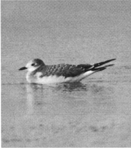
This juvenile Sabine's Gull at Green Key, New Port Richey 6 October 2001 provided the first documented record for the Florida Gulf coast away from the Dry Tortugas.