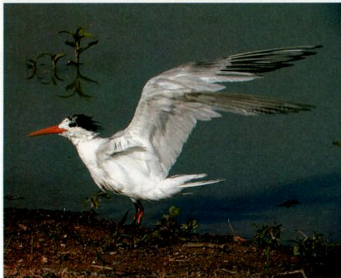
The second Elegant Tern in New Mexico was found at Farmington 18 July 2001, just two months after the state's first record.