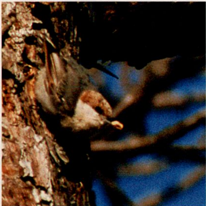
This dapper Brown-headed Nuthatch was present from 11 July through 15 September at Illinois Beach State Park, the same site occupied by last year's unbelievable Red-cockaded Woodpecker! The nuthatch provided Illinois's first confirmed record.