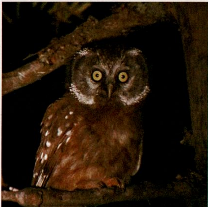
Completely unexpected this summer was the discovery of nesting Boreal Owls in the White Mountains of New Hampshire. This image of a juvenile bird was captured 4 August 2001 near the summit of Mount Pierce. Other northern owls (Northern Hawk Owl and Great Gray Owl) also nested well south of typical range in other regions, following a remarkable winter invasion of all three species.