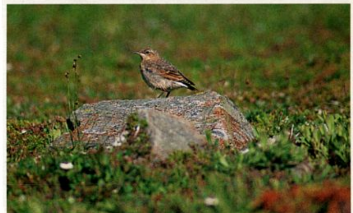
This fledgling Northern Wheatear was one of a brood of six raised at Cape Pine, Newfoundland. This location is 700 km south of the southern breeding limit at Black Tickle, Labrador.