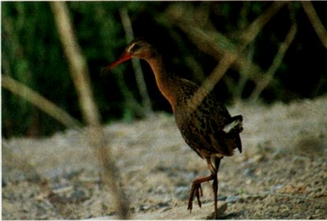
The yumanensis subspecies of the Clapper Rail is a taxon federally listed as Endangered; its status in Nevada was virtually unknown until the late 1990s. In recent years, however, this furtive denizen of emergent wetlands has been documented as a breeder at various sites in the Colorado River drainage above Lake Mead. This bird was photographed at Overton Wildlife Management Area.