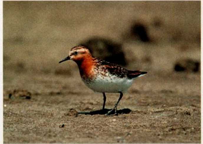
The shorebird highlight of the summer in California was this alternate-plumaged Red-necked Stint at Moss Landing, Monterey County photographed on 14 July.