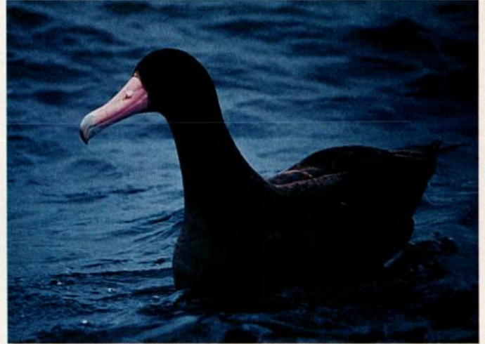
This juvenile Short-tailed Albatross was photographed 24 March 2001 at Perpetua Bank, off Newport, Oregon. This record constitutes the state's third but first photographically documented.