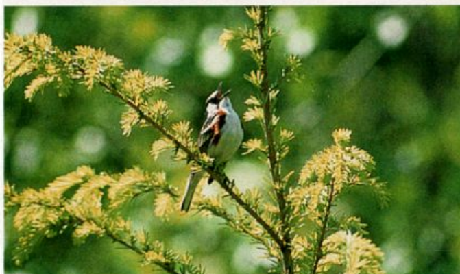
One of four Chestnut-sided Warblers reported at the end of spring and early summer in the Yukon/British Columbia Region, this individual furnished the first record for the Sunshine Coast; it was present 16 June to 1 July.