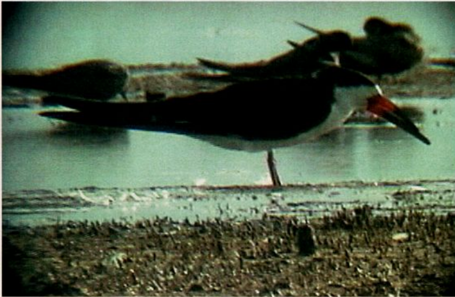
This digiscoped image taken on 20 July nicely documents Colorado's first Black Skimmer from Jet Lake, Kiowa County, which remained 19-21 July. The species was also found as a vagrant in New Mexico this summer.