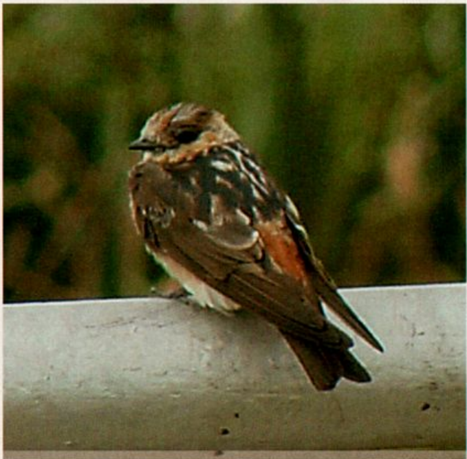
One of two birds present, this somewhat ragged Cave Swallow at Cheyenne Bottoms, Barton County, Kansas raises prospects that they may be breeding in the Region. The cinnamon auriculars (not dark, as in juvenile Cliff Swallow), pattern of face/cap and early wing molt indicate Cave Swallow.