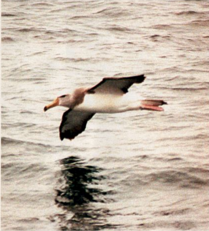
This Shy Albatross photographed over Bodega Canyon, Marin on 27 July 2001 may be the same individual, or one of the same individuals, involved in multiple sightings in the same waters in 2000, but this has yet to be determined. Amazingly, this is the third year in a row in which this species has occurred in California waters.