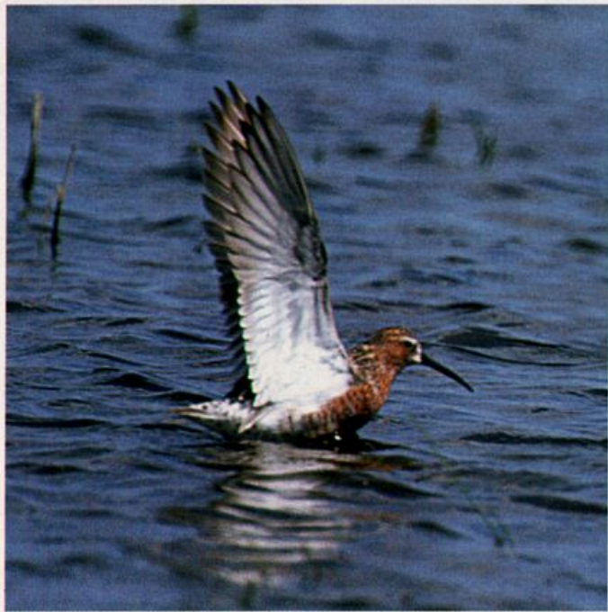
This Curlew Sandpiper delighted many observers at Whitewater Lake, Manitoba between 2 and 7 June, while frustrating a few Manitoba birders "stranded" at Churchill for the week!