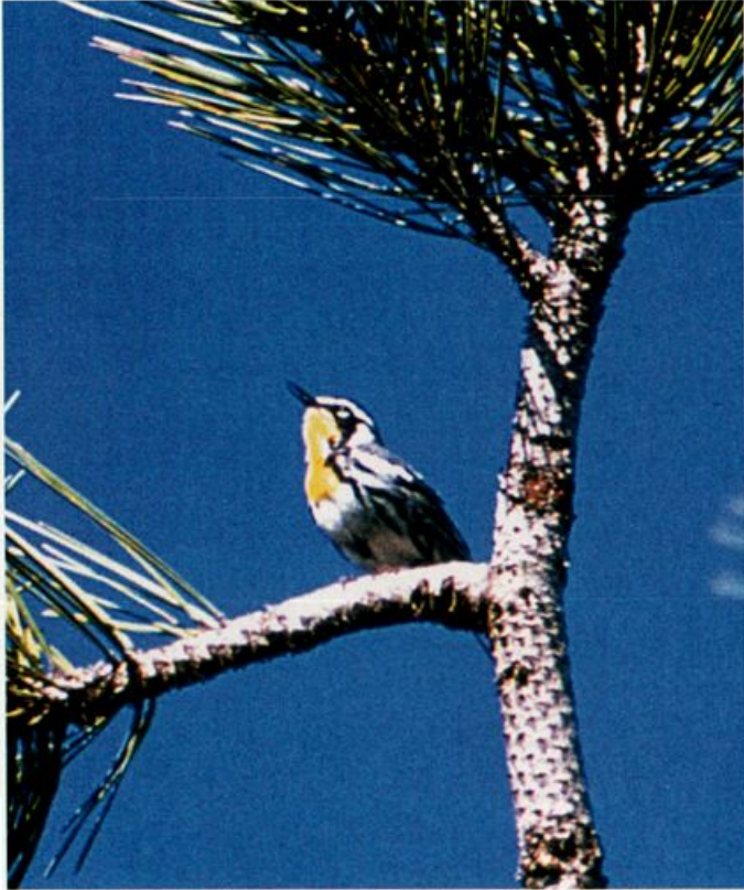
The second documented record for North Dakota, this male Yellow-throated Warbler was photographed 8 June 2001 in the Ponderosa Pine Area of Slope County in the southwestern corner of the state.