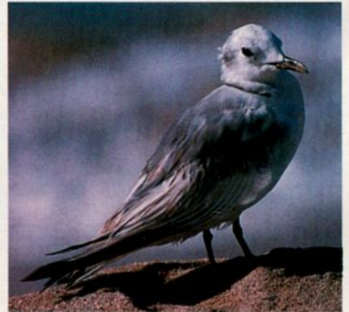
One of up to seven immature Black-legged Kittiwakes near San José del Cabo 4-8 July 2001. Even one kittiwake in Mexico would seem a good find, but seven in summer is extraordinary!