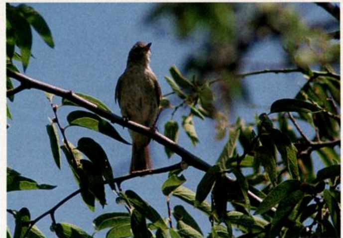
This Northern Beardless-Tyrannulet photographed at Cibolo Creek Ranch on 19 July 2001 was a first for West Texas and well away from its normal haunts of the Lower Rio Grande Valley in that state. It was so far out of range, in fact, that observers wondered whether it might not have strayed from western Mexican populations.