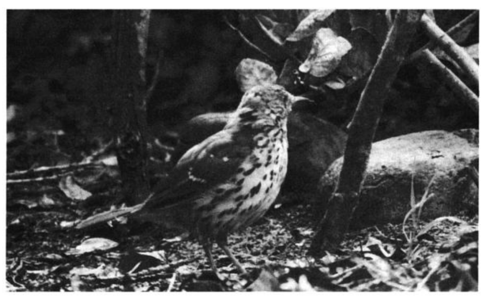
A Brown Thrasher at Cabrillo National Monument at the southern tip of Point Loma in San Diego on 9 August evidently spent most of the summer at this location.

An ad. Little Blue Heron in the Prado Basin,