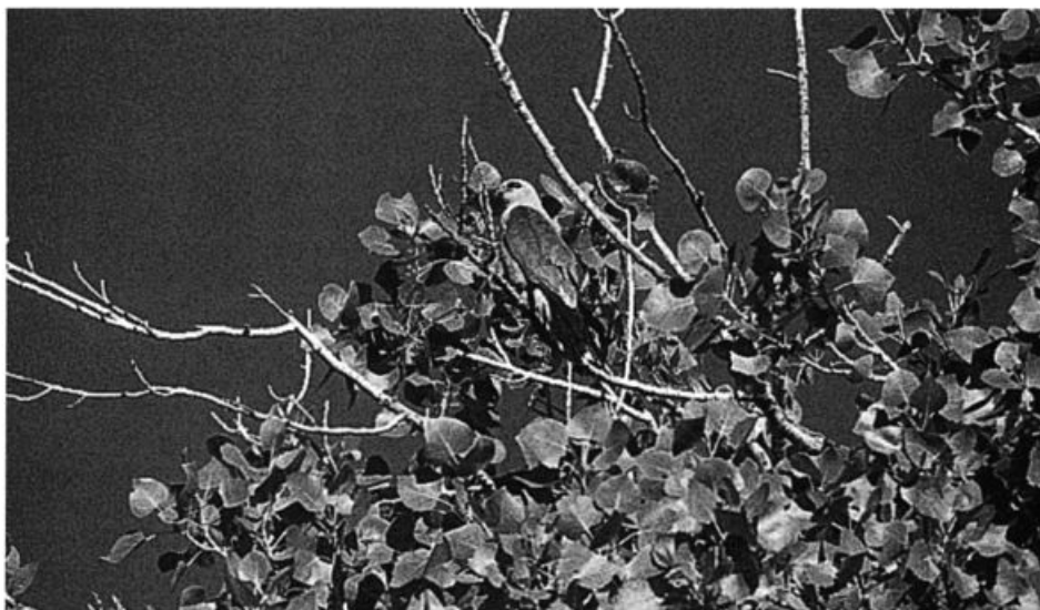
This adult Mississippi Kite photographed on 6 June was one of many outstanding regional records from Warm Springs Ranch, Clark County, Nevada in the early summer of 2001.

Iron , UT on the unusual dates of 5–8 Jun (†RD). Common Terns made a good early showing in Utah, with reports at three locales 18–22 Jul led by 17 at the Geneva settling ponds, Utah 18 Jul (RSt); meanwhile, a single Common Tern at the Ruby L. Fish Hatchery, Elko , NV 28 Jun (WW) was notable. A Least Tern (*) at the Geneva settling ponds, Utah , UT 22 Jul (JB & KB) was a great find.