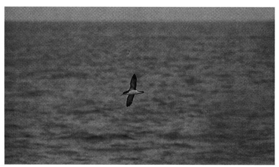
This Manx Shearwater was one of several spotted off Hatteras Island, North Carolina this summer; it is normally quite rare in summer in the Gulf Stream.

Parasitic Jaegers are normally hard to come by in summer; thus of note were singles at C. Hatt. 22 Jun (SCa) and off Hatteras 29 Jul (BP et al.). Very rare and unprecedented for midsummer was a Long-tailed Jaeger off Hatteras 7 Jul (BP et al.). Less unusual were migrant Long-taileds off Hatteras later in the month, 28 & 29 Jul (BP et al.). A gull photographed on the beach at the Cedar I., NC Ferry Terminal 8 Jul (R&SB) looked like an imm. Iceland at first, but was later thought to be some kind of hybrid due to several structural characters. Whatever it was, it was a most unusual sighting for midsummer. Georgia had several summer Lesser