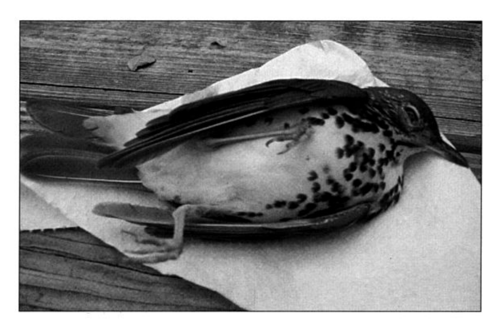
This Wood Thrush struck a window at Nassau, New Providence 28 May, a rather late date for a migrant through the Bahamas.

(RH), providing a first report from that location. A second-winter Herring Gull was recorded on 19 Mar from Potsworks, Antigua (RH), one of the few reports from that island. The tally of Laughing Gulls (50), Royal Terns (10), Bridled Terns (24), Least Terns (3), and Brown Noddies (24) at Spanish Wells, Eleuthera, Bahamas 21 May (NM) may indicate local breeding. A Sandwich Tern was noted at Pigeon I. National Landmark, St. Lucia 7 Mar (IB), and one at Castle Harbour, Bermuda provided a rare occurrence (AD, JM). Twenty Roseate Terns were noted migrating past Little Whale Cay 11 May (WB et al.), while NM counted 12 there the next day. Egg dates for breeding Roseates in the Virgin Is. begin around 20-26 May (RLN). At Trou Caiman, near Port-au-Prince, Haïti, 22 Caspian Terns were noted 3 Mar (JRC) and one Gull-billed Tern was studied near Gonaives, Haïti 10 Mar. A Sooty Tern at Bermuda 22 May was an unusual visitor there (DBW); it was injured and perished (*Bermuda Aquarium & Museum).