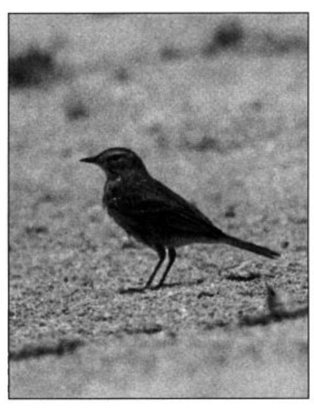
A Palm Warbler, an island first, was photographed in May at Petite—Terre, Guadeloupe.