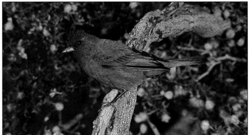
This male Indigo Bunting was captured on film 12 May at Corn Springs, near Desert Center, Riverside County, California; like many trans-Gulf migrants, the species was found in above-average numbers in the Region this spring.

Thirty-one wood-warbler species were recorded in the Region this spring, with impressive showings of such e. species as Northern Parula and Hooded Warbler. A Golden-winged Warbler, casual in California, was at Pt. Loma 15–19 May (REW). Tennessee Warblers were at Morongo Valley, San Bernardino 19 May (DM, EAC), Pt. Loma 28 May (REW) and Torrance, Los Angeles 28 May (DLM). A Virginia's Warbler at Butterbredt Spring 5–6 May (TEW) was the first well-documented spring record for Kern . At least 29 Northern Parulas were found 18 Apr–11 June, with 20 along the coast and 9 in the interior; an exceptionally early migrant was at G.H.P. 29 Mar (KP). Chestnut-sided Warblers were at Pt. Loma 22–23 May (MF), Huntington Beach 9 Jun (BED), and inland at Anza-Borrego Desert S. P. 19 May (MG) and Ridgecrest 3 Jun (SSt), the wintering bird in Lake Forest, Orange was last seen 8 Apr (JEP), and birds in Encinitas, San Diego 20 Mar (GCH) and near Glendale, Los Angeles 22 Apr (RBa) were possibly wintering locally. Magnolia Warblers were at San Nicolas I 22 May (RAH), California City, Kern 20 May (JCW) and Butterbredt Spring 2 Jun (TEW). Townsend's x Hermit Warbler hybrids are noted