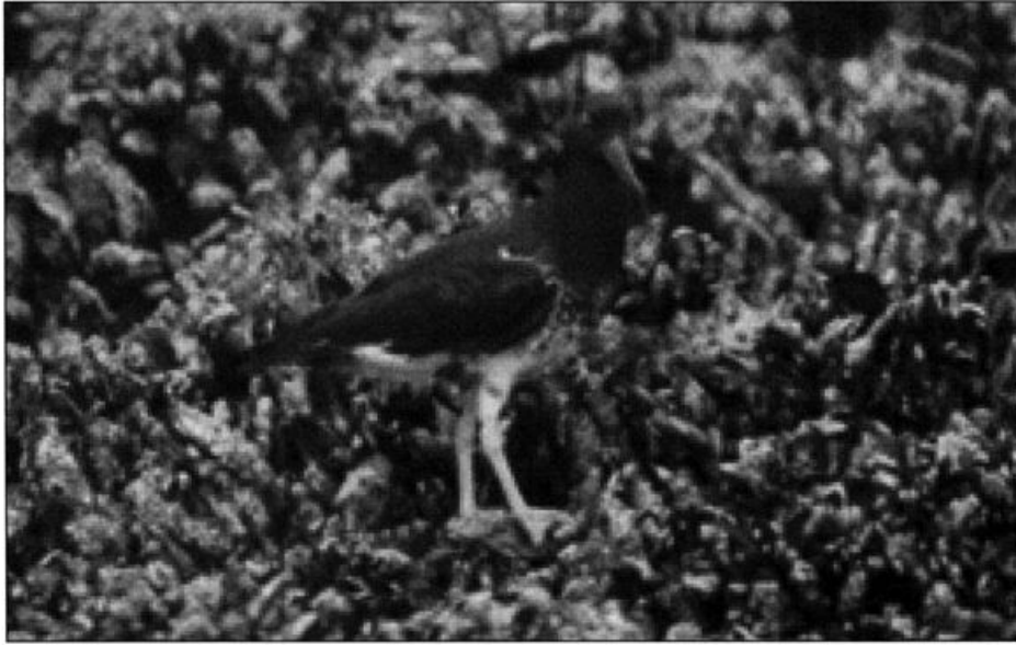
This oystercatcher, apparently a hybrid between American and Black Oystercatchers (rather than a partly melanistic American Oystercatcher), was photographed 9 June on Santa Cruz Island and was one of several such hybrids present in southern California this spring.