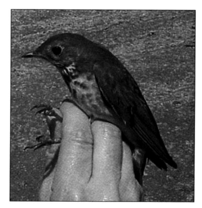
A Gray-cheeked Thrush banded in Colorado Springs in May was one of a dozen found in the Region this spring.