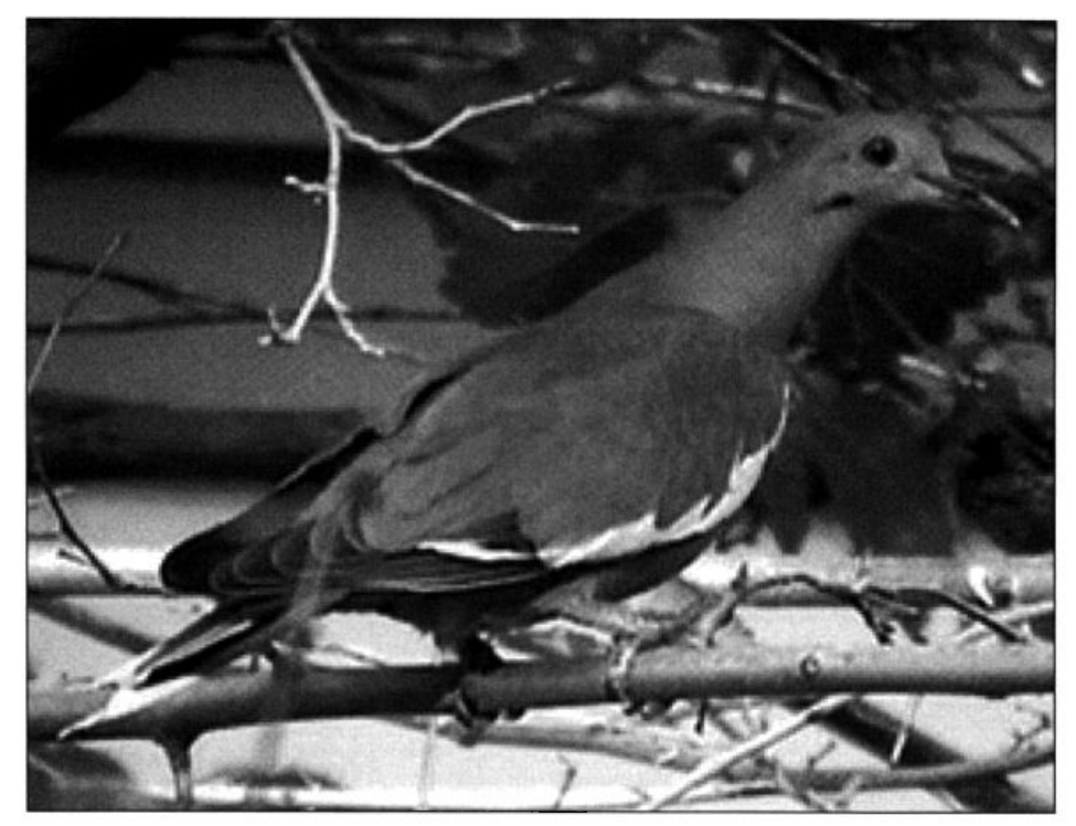
This White-winged Dove in Pueblo, Colorado appeared 28 May and remained through the early summer The species in now found out of core range throughout the United States, as is true for several other columbid species.