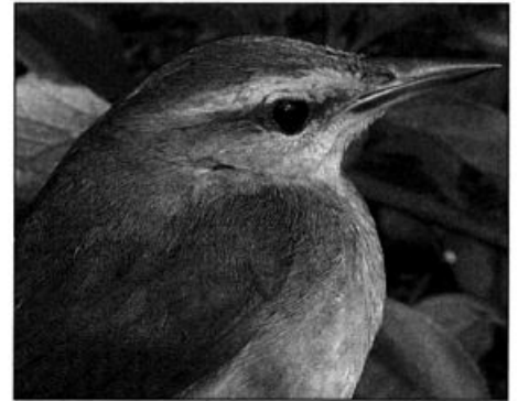
In recent years Swainson's Warblers have been regularly overshooting their known breeding range. This bird, banded at Powdermill Nature Reserve 15 May 2001, was one of two found in Westmoreland, Pennsylvania this spring.

A King Rail at Geneva Marsh, Crawford, PA 27 Apr (RFL) was the Region's lone report. Eight Virginia Rails were at Grand R. W.A., Trumbull, OH 30 May (CB), and an ad. with 6 chicks was at Shady Valley 20 May for one of the few breeding records for Tennessee (WC). A dozen Sora were seen in just a small section of the marsh at Geneva, PA 16 May (RFL), where the species is apparently doing well. The first Sandhill Cranes had returned to their breeding area in Lawrence, PA by 3 Mar (BD), and sightings of migrants came from five other Pennsylvania counties, led by a flock of 19 at P.I.S.P. 15 Mar (LWa). Almost unknown in Pennsylvania 20 years ago, the Sandhill Crane's eastward range expansion is nothing short of remarkable. Elsewhere in the Region, one crane was in the French Broad R. Valley, NC 1–13 Mar (MW, WF), and one at Mosquito L., OH 18 Apr (DH).